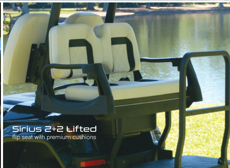
Sirius 2+2 Lifted flip seat with premium cushions