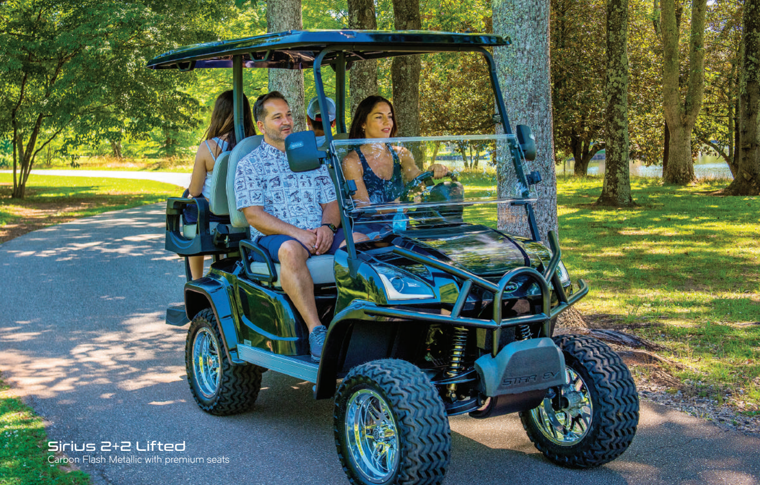
Sirius 2+2 Lifted Carbon Flash Metallic with premium seats