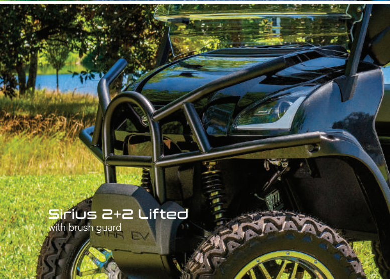
Sirius 2+2 Lifted with brush guard